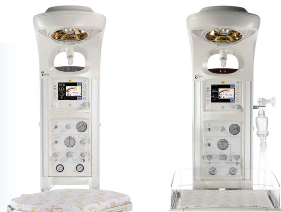
GIRAFFE WARMER PANDA WARMER

The Giraffe Warmer is intended for use in a neonatal intensive care unit (NICU). It features a mattress that can be rotated as needed by the operator to gain better access to the patient. It also includes a general observation light and procedure light.